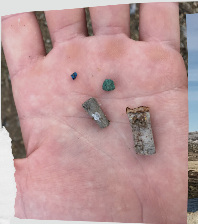
Figure 3 Examples of microplastics found on Lake Jindabyne

The presence of litter and plastic in the Snowy Mountains may impact a visitor's perception of the pristine ecosystem, due to the growing knowledge of microplastics (plastic litter <5mm) impacts on waterway ecosystems and potential harm it may cause from the consumption of animals containing plastics. 5