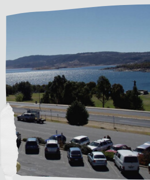
Town Centre car park