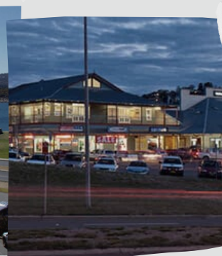
Nuggets Crossing Shopping Centre car park