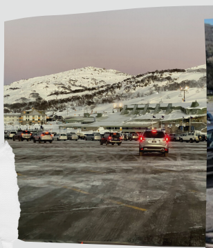
Thredbo car park