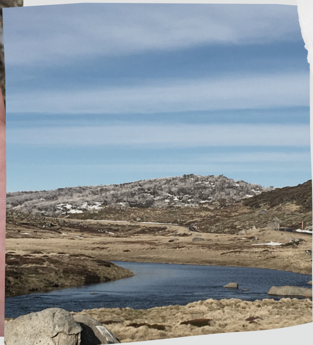
Figure 4 The iconic Snowy River