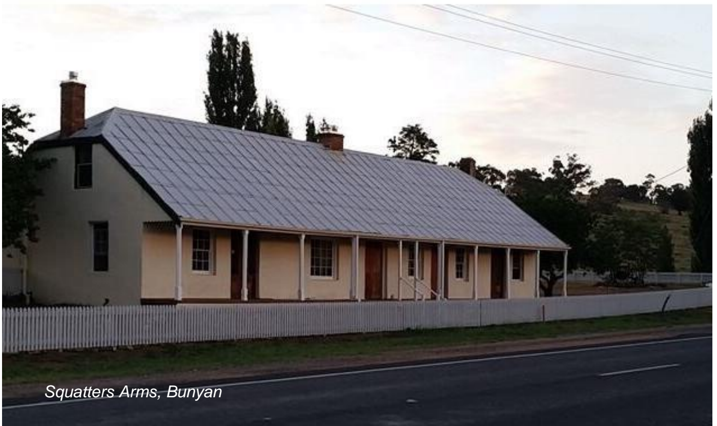
Squatters Arms, Bunyan