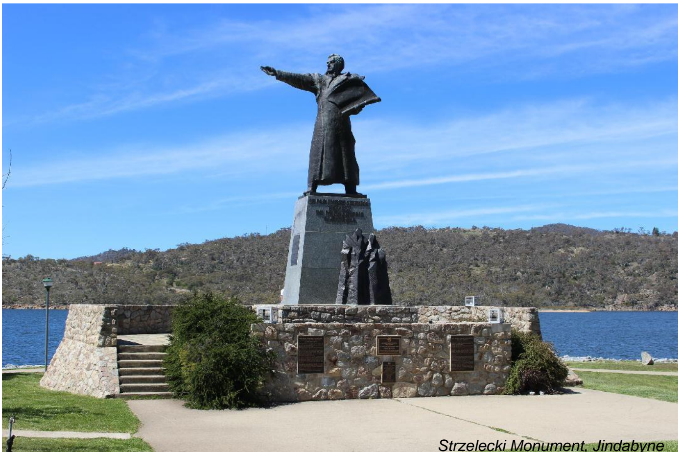
Strzelecki Monument, Jindabyne